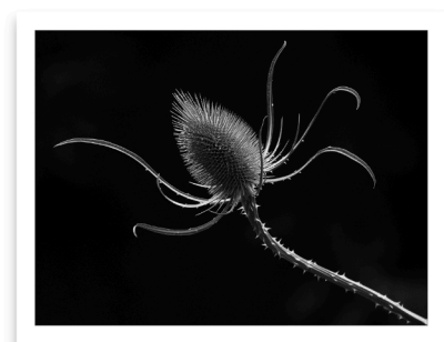
1 Tentacles (T) by Steve Peel

Following the AGM the result of the monthly set subject competition final was announced after an online poll involving the top3 images from the past 12 months. Congratulations to the winners. Results attached to email.