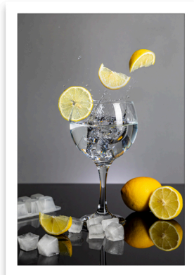
2 Ice and a Slice (I) by Trev Mills