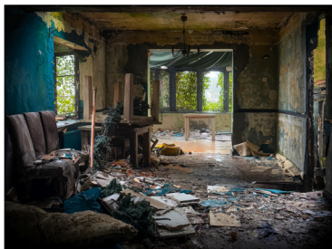
1 Abandoned by Sean McCarthy

Following the Easter break, on Wednesday we reviewed and discussed the results of the April monthly set subject competition (alphabet subject A) in the Hut. Congratulations to the top 3 images. Results attached to email.