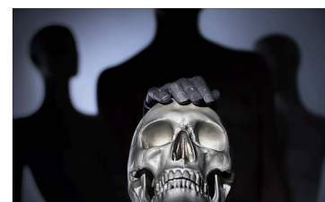
3 AI Upgrade by Graham Wilcock