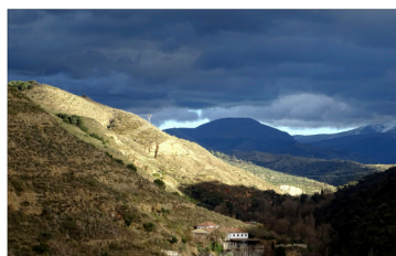
2 It's Black Over Bill's Mother's by Kev Neylon