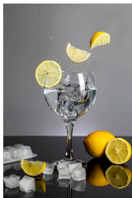
1 Ice and a Slice by Trev Mills

On Wednesday we reviewed and discussed the results of the January monthly set subject competition (alphabet subject I) via Zoom. Congratulations to the top 3 images. Results attached to email.