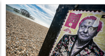
2 Conservation Mixed Messaging by Graham Wilcock