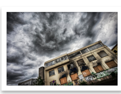
2 AI Apocalypse by Graham Wilcock