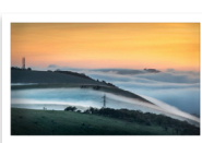
South Downs Mist