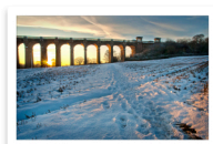
Balcombe Viaduct

Back in February the MSK (Physio) Dept at Crawley Hospital approached CCC for a selection of images to use in their re-decoration of the patient waiting area. They eventually selected six images which they have had printed A0 size (with photographer and CCC credits). They now have four on display and will rotate other images later.