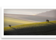
Trees On The Hill, South Downs by Steve Yates

If you are around the Hospital then the MSK display is situated just past the main reception area then diagonally to the left.