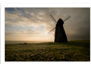
Beacon Hill on South Downs