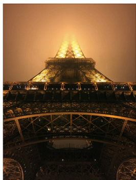
1 Eiffel Tower by Phil O'Dell

On Wednesday at the Hut the results of the July monthly set subject competition (alphabet subject E) were presented and images discussed and critiqued. Congratulations to the top 3 images. Results attached to email.