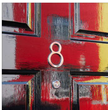
2 Eight by Steve Peel