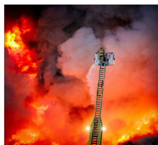
1 Fire, Smoke, Toxins and Waste by Colin Paul of CPA (27/30)

Edition 100 - and a look back at some images from the first edition in late Feb 2022 with the first (tele)Photo Challenge winners (which involves CCC and clubs from Belfast, Cardiff and Edinburgh).