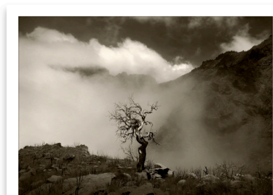
1 Mountain Tree (M) by Steve Yates

Finally the results of the "final" monthly set subject competition were presented. Congratulations to the top 3 images. Results attached to newsletter email.