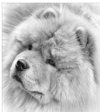
2 Charlie the Chow (C) by Ian Woods