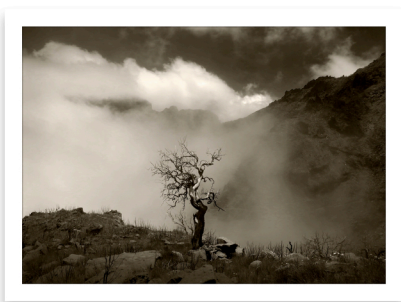
1 Mountain Tree by Steve Yates