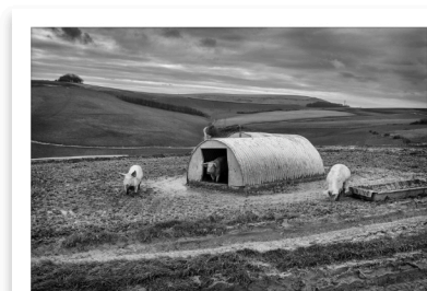
3 Mucking About by Steve Yates

This is the final competition of the current series and we immediately start the "final" poll comprising the top 3 images from the past 12 months - results to be announced following the AGM this coming week.