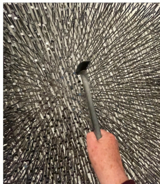
2 Nails by George Redgrave