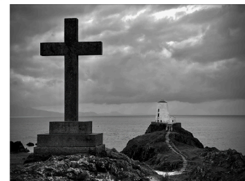
3 Cross by Phil ODell

This month we had 42 images from 14 photographers and there were many excellent images representing different interpretations of the letter C - reflected in some close marks. It is especially good to see our newer members participating. The competition/challenge provides a useful "safe space" to test out images and ideas and get feedback on how the images might be prepared for camera club competitions when external judges review the images. Whilst it is always good to submit images you like - the judges will be comparing images on the night against each other using technical, creative and story-telling criteria.