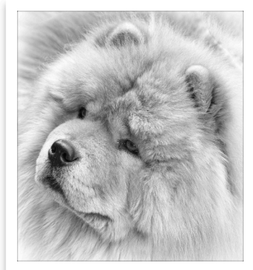
3 Charlie the Chow by Ian Woods

This concludes the winter Zoom-based ODI Competition - and so congratulations to the top-placed photographers in this competition