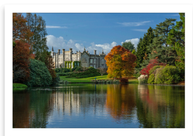
2 Sheffield Park