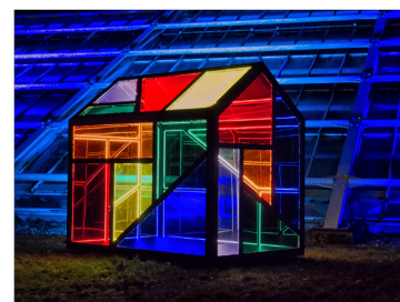
3 Lightroom by Steve Peel