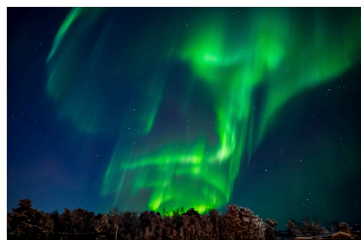
1 Dancing Northern Lights by Andrew Kernan

On Monday's Zoom meeting the results of the December monthly set subject competition (alphabet subject L) were presented. Congratulations to the top 3 images. Download results here CCClick (link expires in one week). The monthly competition in January is the letter "Z and/or X". Plenty of time to sort your images.