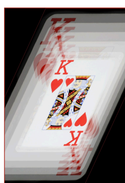
2 Kings of Hearts