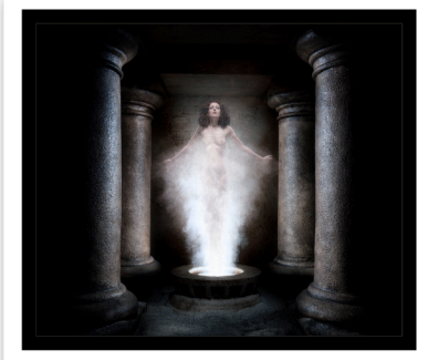
2 From Out of the Earth Came a Creature of the Air by Paul Holroyd