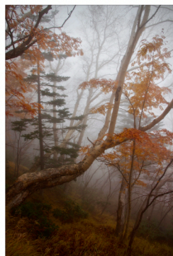
2 Japan by Phil O'Dell