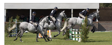
3 Triple Jumper by Steve Peel

The post-comp analysis generated much discussion about the image, titles and voting considerations and with more (and new) members joining in it was considered time for a reminder and refresh of the competition guidelines for this popular set subject challenge. These will be circulated before the next round in late Nov.