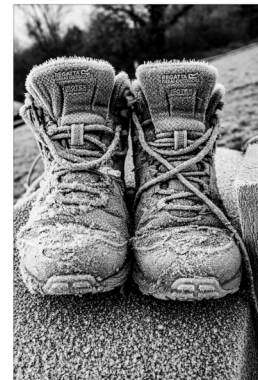
3 Hoar Frost boots by Andrew Kernan

It has been suggested that we add a separate "critique" meeting after the results at which we can discuss in more detail some (say 10) of the images in each month's competition (or shorten the results presentation and use second half of meeting differently). This would specifically discuss the taking and processing of the images and maybe areas to consider changes (eg for subsequent use in Club competitions etc). Please reply to the newsletter email (it won't go to everyone) if you would be interested in participating in such a critique meeting.