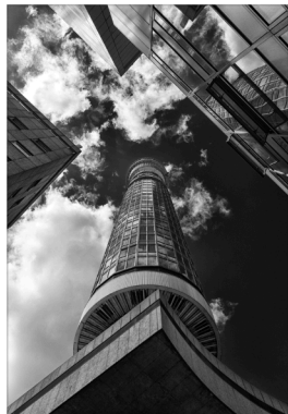
1 High-point by Steve Peel

On Monday the results of the September monthly set subject competition (alphabet subject H) were presented in the Hut - to show off the new bright, clear, large Club projector and screen. Congratulations to the top 3 images. Download results here CCClick (link expires in one week).