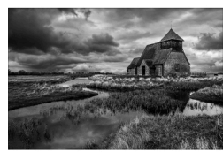
1 On Romney Marsh