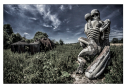
=3 Amongst the Ruins by Graham Wilcock