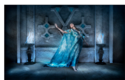
=3 Caeruleus by Paul Holroyd