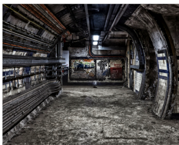
2 Euston Unused Underground by Steve Peel