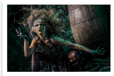
1 Wild Thing by Graham Wilcock

On Monday's Zoom meeting Lawrence Homewood judged our Club PDI Competition Round 2. Congratulations to the top 3 images. Download results here CCCLink (link expires in one week).