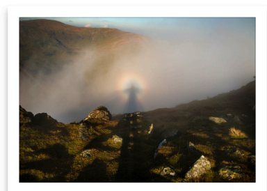
1 Brocken Spectre by Steve Yates

On Monday's Zoom meeting the results of the May monthly set subject competition (school curriculum subject Physics) were revealed. Congratulations to the top 3 images. Full results can be safely downloaded from the wetransfer website using the following link CCCNews030622 (click link) (link expires in one week).