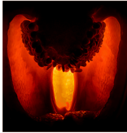
1 A Pepper Dissected by Paul Holroyd

On Monday's Zoom meeting the results of the March monthly set subject competition (school curriculum subject Nature) were revealed. Congratulations to the top 3 images.