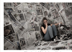
"Chaotic world" by Graham Wilcock - runner-up