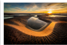
2 West Wittering Sands by Steve Yates of CCC (26/30)