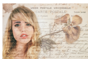
"Memories of a Road Not Taken" by Graham Wilcock - first placed image of the round

(tele)Photo Challenge results and PDI Comp Round 3 results can be downloaded safely to your device via wetransfer using the following link CCCNews250222 (click link)