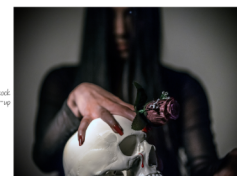
"Dark Ritual" by Graham Wilcock - 2nd runner-up